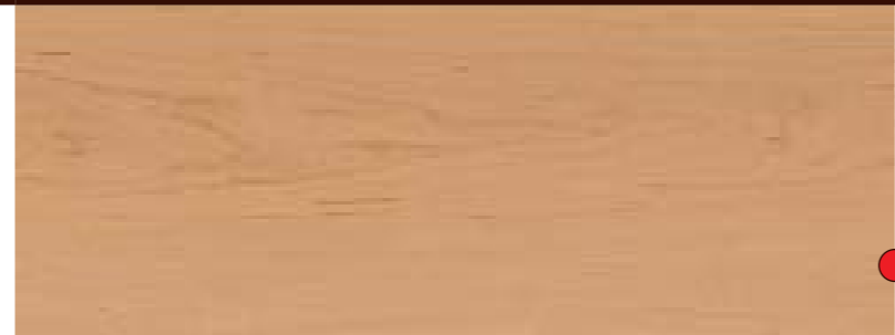
● Victoria Maple – CAH2131LA – 1 strip