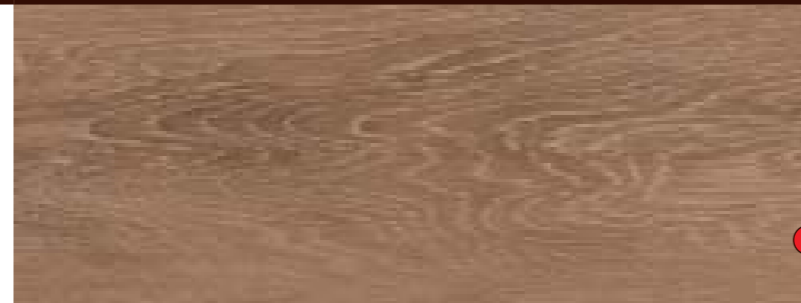
● Alba Oak Siena – CEI2333LA – 1 strip