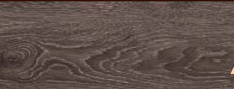
▲ Everglade Oak – CEI3377LA – 1 strip